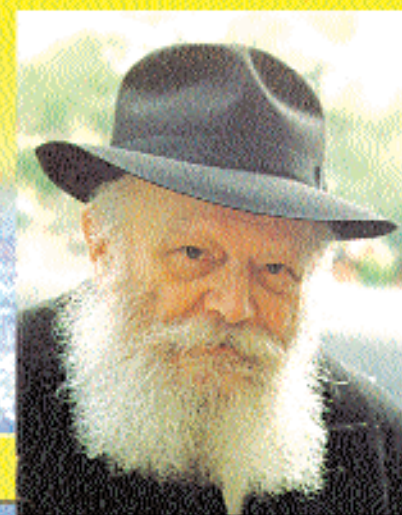
The Rebbe King Moshiach שליט"א